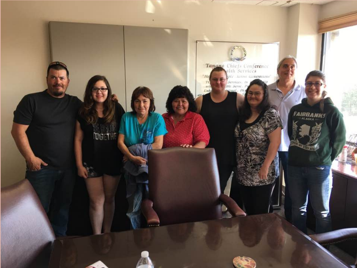
Group at the July 2017 Corporation Meeting