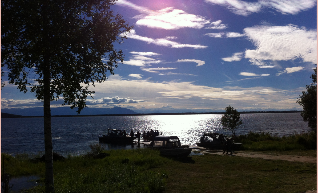
Guests of the Fall 2017 Subregional Boarding Boats