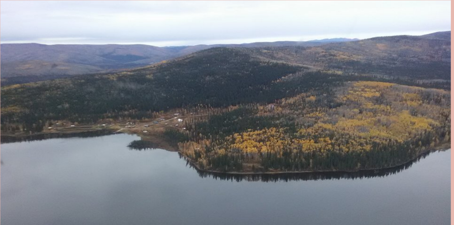
Aerial View of the Healy Lake Village