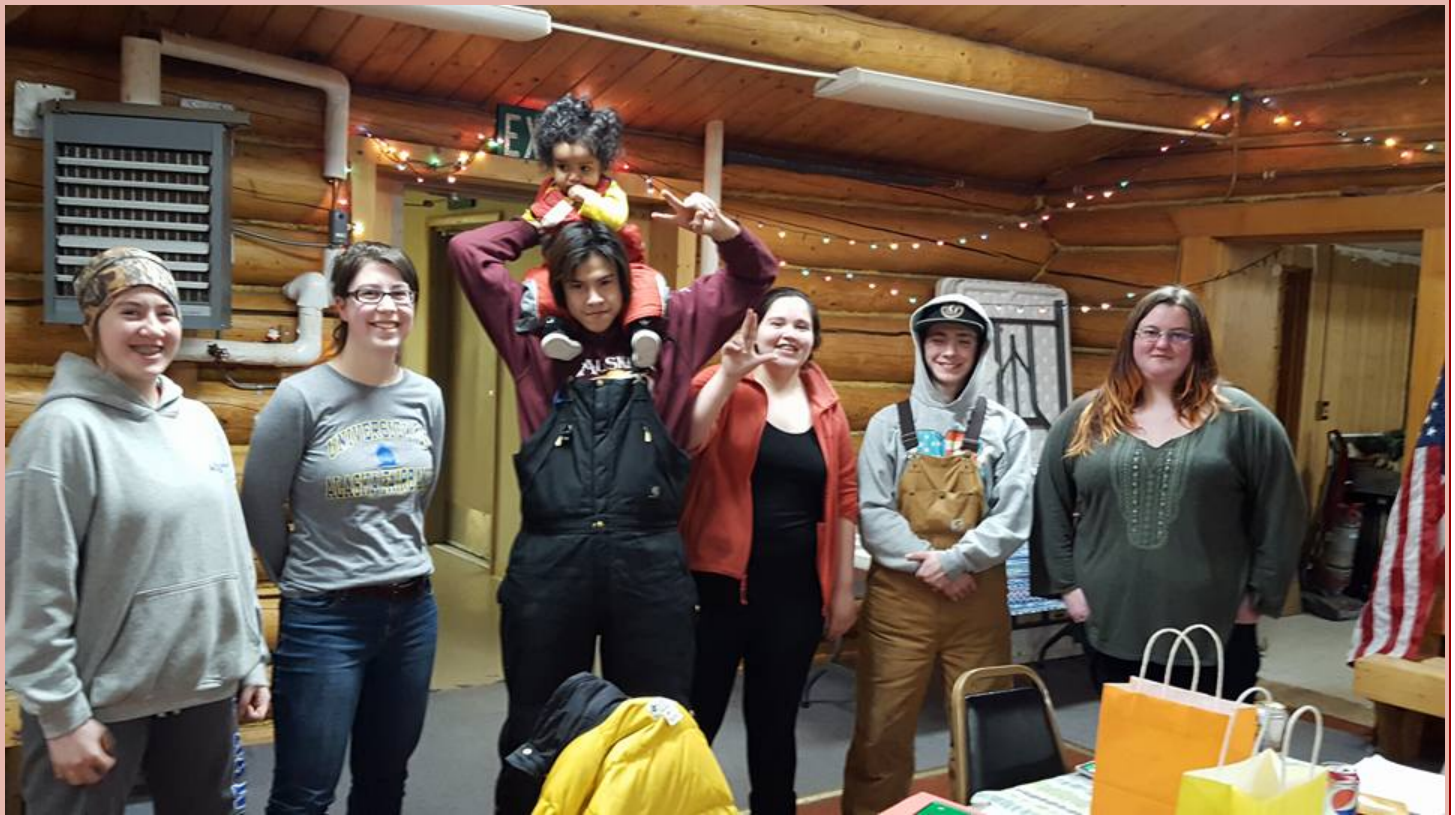
Our First Youth Council Meeting on January 13, 2018