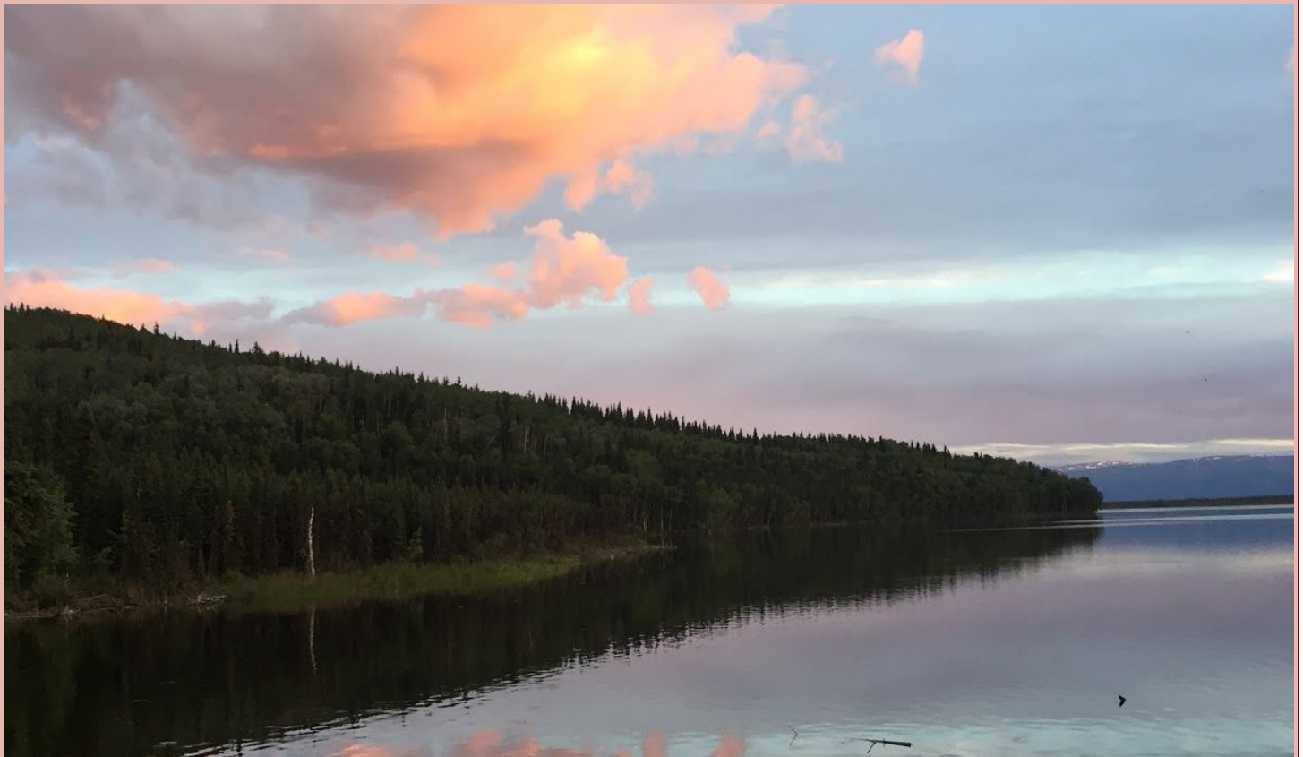
Sunset at Healy Lake