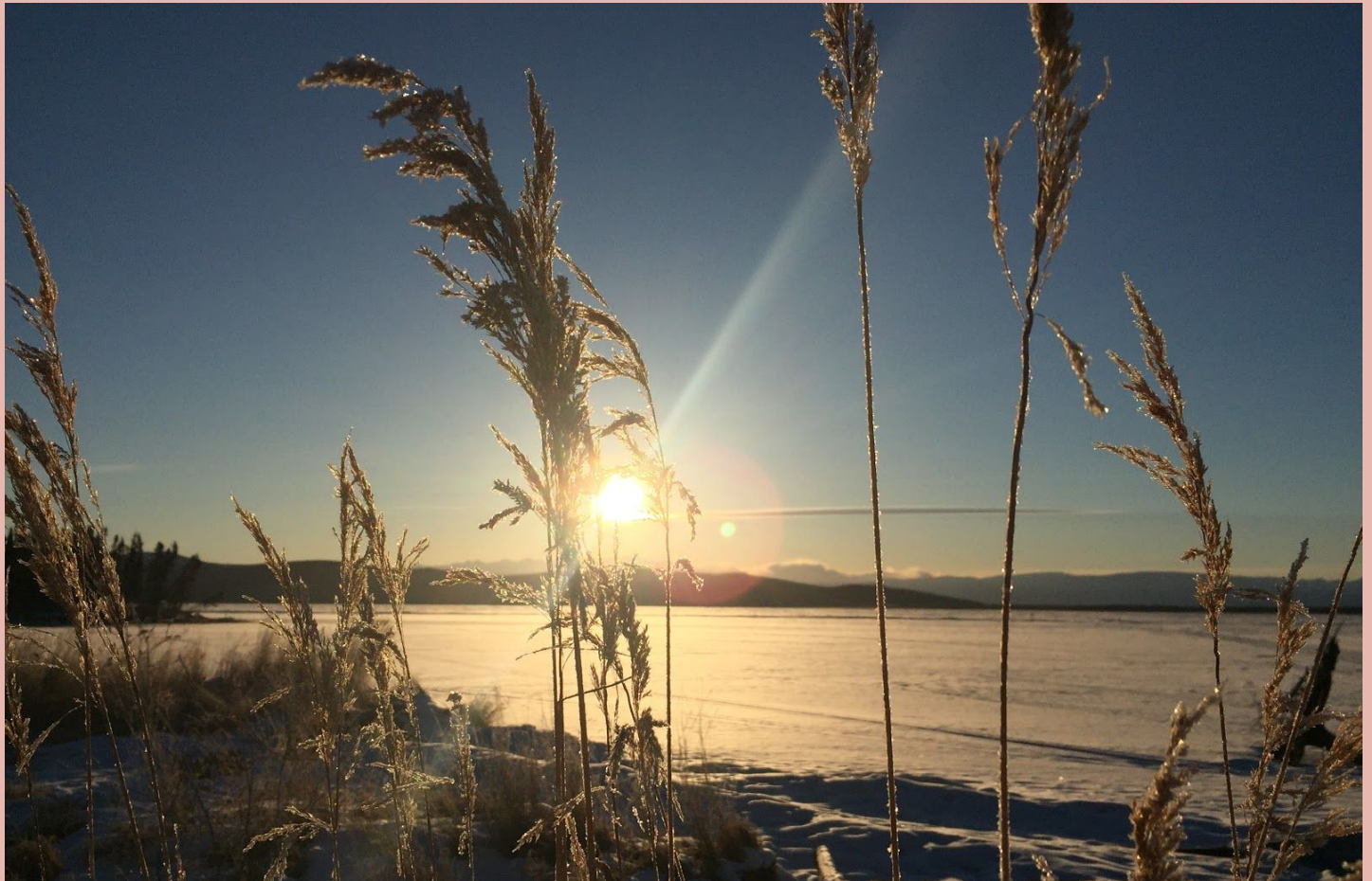
Healy Lake, January 2019